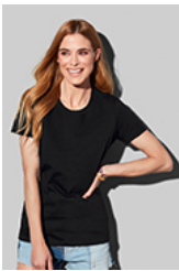
ST2160 Comfort-T 185