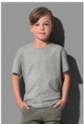
ST2220 Classic-T Organic Kids