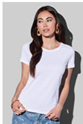
ST2620 Classic-T Organic Fitted