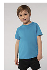
SOL'S SPORTY KIDS 01166