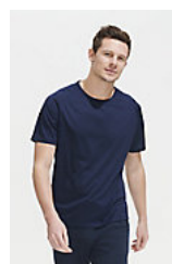
SOL'S SPORTY 11939